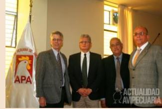
USGC DDGS seminars in Peru